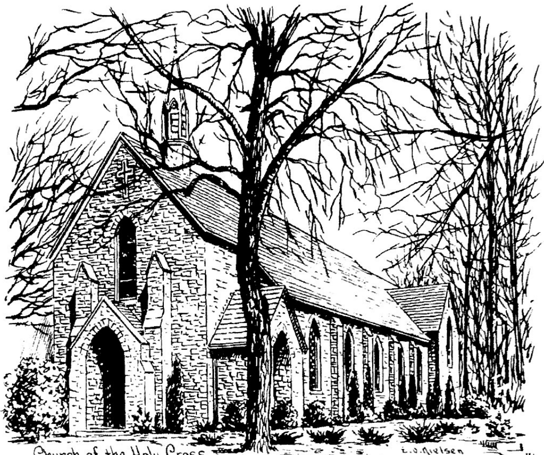
Church of the Holy Cross Tryon - North Carolina

The Episcopal Church of the Holy Cross 150 Melrose Avenue ~ P. O. Box 279 ~ Tryon, NC 28782 Phone - (828)859-9741 www.holycrosstryon.org